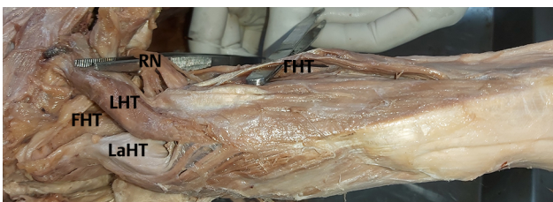
Fig. 2 The nerve supply and insertion of fourth head of triceps brachii. FHT: fourth head of triceps; LaHT, lateral head of triceps; LHT, long head of triceps; RN, radial nerve.