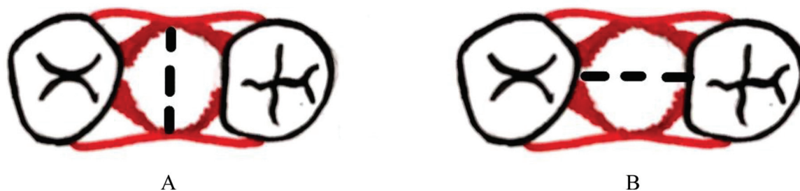
Fig. 2 Wound diameter in buccolingual (A) and mesiolingual (B) direction.

over the two study groups (► Table 1 ). No complication of extraction such as wound dehiscence, nerve disturbance, or prolonged pain was registered, nor allergic reaction was experienced by participants.