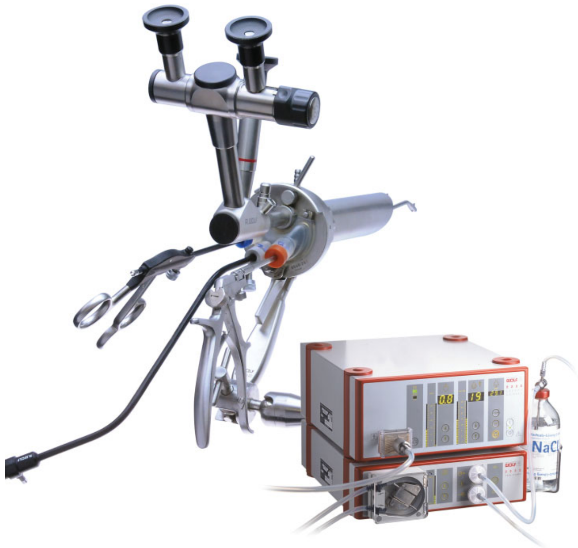
Fig. 1 Transanal endoscopic microsurgery, Richard Wolf GmbH, Germany.

The advantage of the 4-cm rigid opening of the port is that it can be used to stent the anal canal for distal lesions, to pin the rectal valves for lesions behind them, and to stent the bowel wall for more proximal lesions into the distal sigmoid. Although rigid platforms are less commonly used for transanal total mesorectal excision (TaTME), some proponents