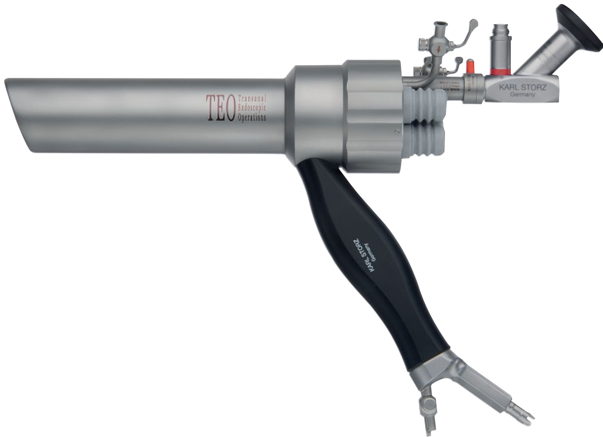
Fig. 2 Transanal endoscopic operations (TEO), Karl Storz SE & Co. KG, Germany.

prefer this ability to stent the tissue independently of the pneumorectum. However, the long rigid resectoscope reduces the working angles of the instruments (► Fig. 3 ). This is partially overcome by proprietary angulated instruments.