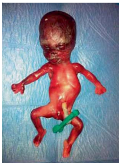
Fig. 2 Fetus (case 2) after TOP with typical normal head size, facial dysmorphism and shorter long bones.

Screening of chromosomopathies was done at 12 weeks' gestation. Findings were negative, and nuchal translucency values were within normal ranges. At 18 weeks' gestation, ultrasound assessment showed a single fetus with a biparietal diameter and a head circumference of 45 mm and 125 mm respectively, which was appropriate for gestational age. The respective femur and tibia lengths were 22.4 and 19.6 mm, which corresponds to the fifth centile for gestational age, while the radius, ulna and humeral lengths were 17.6, 17.6 and 20.8 mm, respectively, which were all below the fifth centile. The amniotic fluid was normal. A further scan for amniocentesis and to monitor long bone growth was performed at 22 weeks' gestation. The karyotype was normal (46XY) and the biparietal diameter, head circumference and head shape were normal. However, measured femur, tibia, fibula, hu-