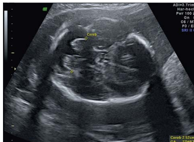
Fig. 2 Fetal ultrasound imaging at 25 weeks of gestation shows hypoplasia of the cerebellar vermis with an enlarged cisterna magna.

endometrial lining was irregular and intracavitary fibroids could not be excluded.