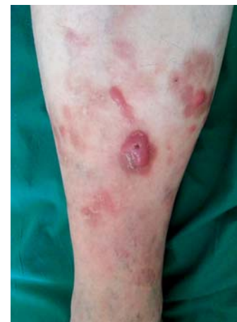
Fig. 1 Red-brown coloured patches and plaques with irregular borders and multiple firm nodes on the anterior surface of the right lower leg.

According to the recommendations of the European Organization for Research and Treatment of Cancer and International Society for Cutaneous Lymphoma consensus [1] for the management of cutaneous B-cell lymphomas, the treatment with polychemotherapy R-CHOP regimen (rituximab-cyclophosphamide, doxorubicin, vincristine, and