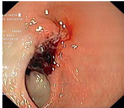
Fig. 2 Ulcer underneath clot.