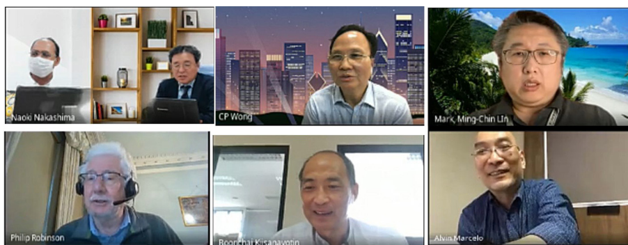
Fig. 3 The General Assembly (GA) Meeting of APAMI held on October 4, 2021.