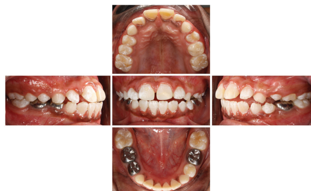
Fig. 4 Recall intraoral photographs at 6 months.

Follow-up appointments were scheduled at 2 weeks, 6 weeks, 3 months, and 6 months. The 6-week visit was to evaluate the traumatized upper permanent central incisors and to take periapical radiographs as recommended by the American Academy of Pediatric Dentistry guidelines. The clinical examination revealed no signs of increased mobility, discoloration, or dental abscesses, and the radiographic examination showed no sign of periapical radiolucency. At the 3-month recall, the patient presented with improved oral hygiene, intact restorations and crowns, erupting premolars, and no new carious lesions. Furthermore, at the 6-month recall, intraoral photographs (► Fig. 4 ), radiographs (► Fig. 5 ), and orthodontic consultations were performed. The clinical