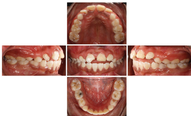
Fig. 3 Preoperative intraoral photographs.

Society of Anesthesiology (ASA) III. Informed consent was obtained from the patient's father regarding the full dental rehabilitation under general anesthesia and the publication of a case report including the sharing of the patient's medical history, radiographs, and intraoral photographs.