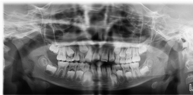
Fig. 1 Preoperative panoramic view radiograph.

Oral examination showed poor oral hygiene, a mixed dentition stage, fluorosis manifested as generalized white spots affecting all dentition, multiple dental caries, tendency to anterior open-bite due to a tongue thrusting habit, and an uncomplicated enamel/dentin crown fracture of the upper permanent central incisors which occurred 3 weeks ago and was treated temporarily with resin-modified class ionomer restoration. Panoramic views (► Fig. 1), bitewings and periapical radiographs (► Fig. 2), and preoperative intraoral photographs (► Fig. 3) were taken. The radiographs revealed normal developing dentition and multiple occlusal and proximal caries with signs of periapical radiolucency related to the upper right primary second molar. After case assessment, the decision was made by the dental team to treat the patient under general anesthesia owing to her medical condition, multiple allergies, and the extent of the dental treatment needed. In regard to the tongue thrusting habit, orthodontic consultation was obtained where the recommendation was to not intervene at this stage and to reevaluate after 6 months. Furthermore, consultations were performed with the neurology, nephrology, and anesthesia departments for clearance. The neurologist considered her to be a high-risk patient and recommended admission for 1 day postoperatively for monitoring in a high-dependency unit (HDU), where the anesthesiologist cleared her as American