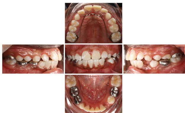
Fig. 6 Postpalatal crib appliance placement intraoral photographs at 1 month.

and radiograph examinations revealed no signs of new caries or periapical lesions, while the updated orthodontic consultation including the placement of a palatal crib appliance for 6 months to stop the tongue thrusting habit and there was a noticeable improvement after 1 month (→ Fig. 6 ). The patient will be seen routinely every 3 months, and orthodontic consultation will be updated accordingly.