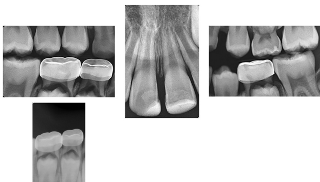
Fig. 5 Recall intraoral radiographs at 6 months.