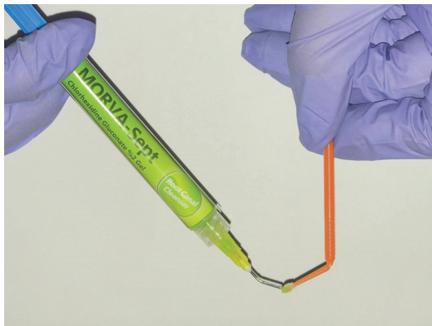
Fig. 2 Applying chlorhexidine gel on a microbrush.

For assigning the participants within each block to one of the three study groups, six potential sequences are possible. Therefore, a sequence was given to each block randomly (i.e., the first participant of the first block enters group 1, the second participant of the first block enters group 2, the third participant of the first block enters group 3, etc.) (→ Fig. 1).