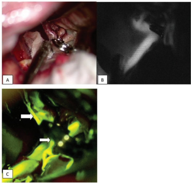
Fig. 3 This 47-year-old female presented with a ruptured 7-mm ACOM artery aneurysm. She underwent clipping of aneurysm through pterional craniotomy (A). The patency of the perforators was more evident on FL-VA (C) compared with ICG-VA (B).

vessels and aneurysms of interest. The image quality of ICG-VA was often deteriorated at higher magnification in deep operative fields, partly due to the chromatic aberration. Blood clots, aneurysm, or brain tissue often obscured the view of vasculature in both ICG-VA and FL-VA. Overall, FL-VA provided superior details throughout the magnification range and was able to identify small and perforating arteries even in deeper operative fields. In one patient (5%), the FL-VA