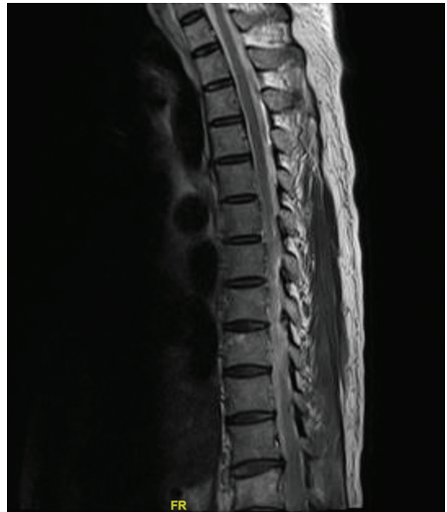
Fig. 1 Postoperative magnetic resonance imaging spine which was normal.