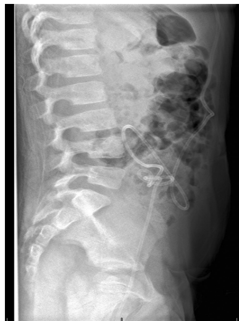
Fig. 2 X-ray lateral decubitus position showing the loop in the right side of the abdomen.

For high-risk or documented infections, the timing of shunt replacement is variable. Treatment time is often guided by cultures of cerebrospinal fluid, which should be negative for several days before the shunt revision is planned. 26 Of the documented pediatric cases, one had the shunt revised in the same session but was given prophylactic antibiotics for 1 week. 8 Another case also had only one surgical intervention with no shunt revision required because the distal shunt was never extruded but rather was stuck in the fallopian tube. 13 In seven of the nine cases that reported follow-up, replacement of the shunt or endoscopic third ventriculostomy was required later after a course of antibiotics. Upon replacement, a new distal site other than