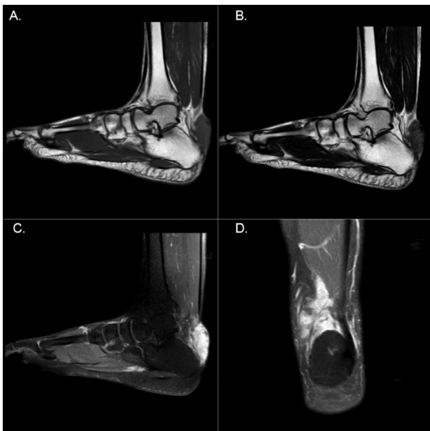
Fig. 3 MR image of the right foot and ankle showing (A) T1-weighted sagittal section image demonstrating T1 isointense soft tissue lesion in the subcutaneous region of the posterior aspect of the foot superior to the calcaneum, encasing the Achilles tendon without infiltration. (B) T2-weighted sagittal section image showing intermediate intensity of the lesion with no obvious erosions; (C and D) dynamic post (gadolinium) contrast T1-weighted images showing homogenous post-contrast enhancement in the lesion.