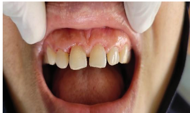
Fig. 8 Postoperative clinical pictures with enhanced aesthetics in the upper front teeth region.

gingival margin position, and no marginal bone loss especially in the anterior region, where aesthetics is of great concern. 27