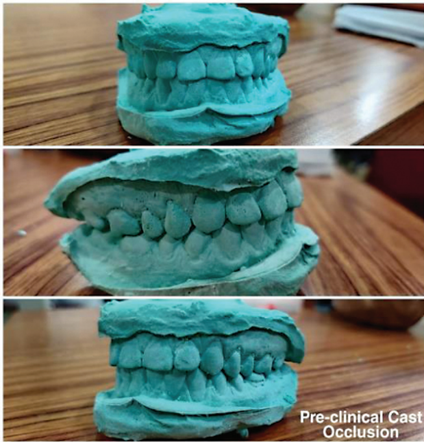
Fig. 1 Dental cast prior to treatment in a 44-year-old female patient presenting with enhanced gum display in the upper front teeth region.

Preoperatively, transgingival probing was performed to determine the level of alveolar crest and as it was more than 2 mm, gingivectomy without osseous surgery was performed.