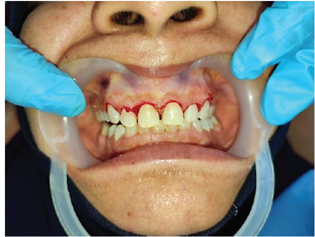
Fig. 7 Intraoperative picture.

However, in a study conducted by Nethravathy et al in 2013, they compared three different surgical techniques of crown lengthening like gingivectomy, apically repositioned flap, and the surgical extrusion technique, which showed several advantages over the other conventional surgical techniques such as preservation of the interproximal papilla,