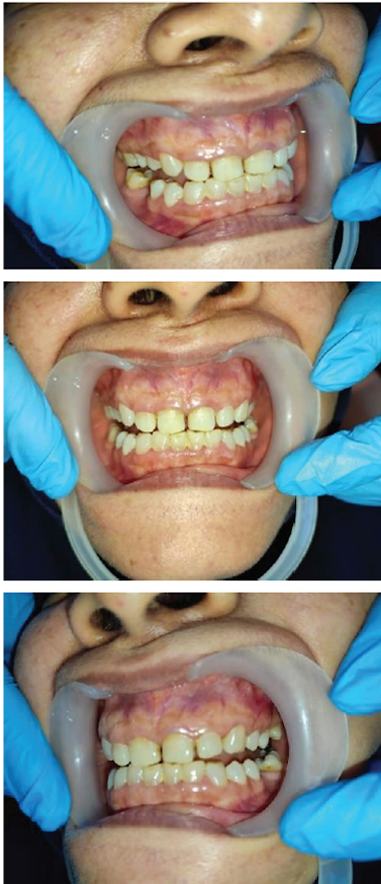
Fig. 6 Preoperative clinical pictures indicating a gummy smile.

increased and ideal crown length with patient-satisfying results in both the cases at 15 days, 1 month, and 6 months of follow-up. 25