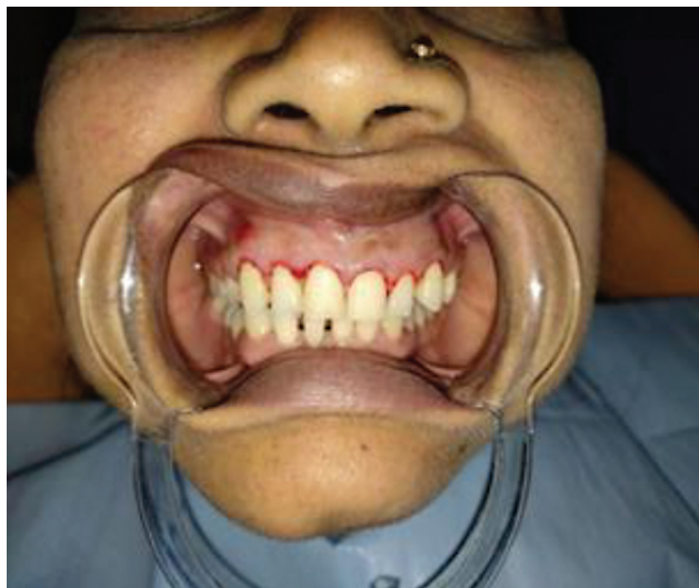
Fig. 3 Gingivectomy.