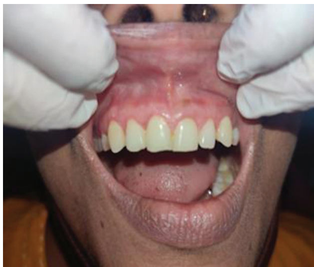
Fig. 4 Postoperative clinical pictures with longer and aesthetic clinical crowns.