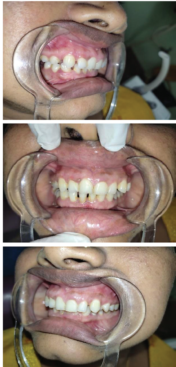
Fig. 2 Preoperative clinical pictures with enhanced gum display and shorter clinical crowns.

A 34-year-old female patient reported to the department of periodontics with the demand for cosmetic correction and “gummy smile.” Clinical examination revealed the extent of attached gingiva (► Fig. 5B ); she had an excessive display of gingiva. A complete medical history and blood investigations were performed to rule out any systemic contraindications for surgery. The initial examination verified the presence of short teeth in relation to the gingival margin, absence of inflammation, and growth of the gingiva (► Fig. 5A ). To evaluate the periodontal condition, probing depth, periodontal attachment loss, gingival bleeding, and suppuration examinations were performed. The periodontal examination verified the presence of healthy gingival biotype (► Fig. 6A–C ). After determining the problem, the surgical technique was determined as crown