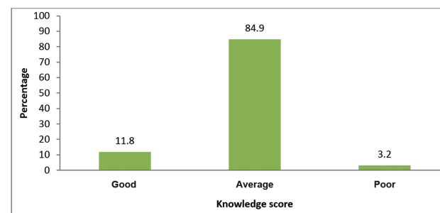
Fig. 1 Percentage of distribution of knowledge score of internship students on emergency crash cart.

The results showed that the majority (84.9%) of the internship students have only average knowledge, 11.8% of internship students have good knowledge, and only 3.2% of them have poor knowledge regarding emergency crash cart. Supporting the findings of the present study, a study conducted