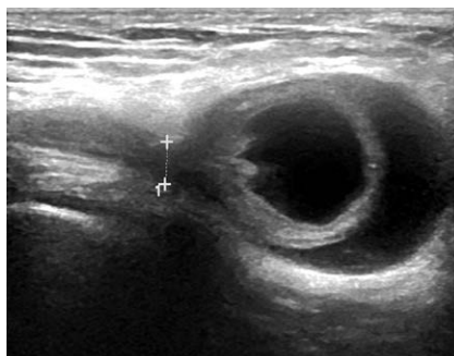
► Fig. 1 Ultrasound findings showing herniation of small intestine.

infection were reported by the patient. During clinical examination, there was slight tenderness of the tumor, but no discoloration of the skin, abdominal pain or fever. Reduction of the tumor was not possible. Standard lab tests were inconspicuous. Suspected for malignant tumor, the patient was referred to the Department of Radiology, North Zealand Hospital for the purpose of ultrasonic characteristics of the tumor and ultrasound-guided core needle biopsy. The ultrasound examination showed a fluid-filled and blind ending structure located medially on the right thigh (► Fig. 1). The wall of the structure was multilayered and showed a subtle pulsatile signal during color Doppler examination. These findings suggested a femoral hernia containing small intestine. The hernia was not amenable to reduction and as such was incarcerated. Surgical repair was therefore indicated. During laparoscopic hernia repair, the hernia was identified (► Fig. 2) and after reduction of the hernia sac, the relevant part of the small intestine proved to be a Meckel's diverticulum (► Fig. 3). The surgeon reported that the diverticulum had initially appeared discolored, indicating some degree of strangulation, but after reduction normal coloration was regained. The diverticulum was resected and the tissue sent for further examination. Histology later showed signs of inflammation and fibrosis. No ectopic mucosa, which may be seen in a Meckel's diverticulum, was present.