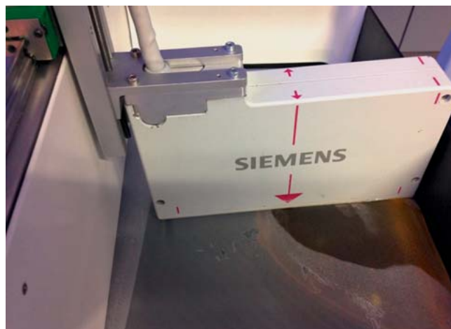
► Fig. 1 The ultrasound probe – taken from the ABVS ultrasound machine – moves over the compressed (elastic gauze) breast phantom.

Patient characteristics are listed in ► Table 1. Various clinical scenarios were chosen in order to provide as comprehensive an assessment of image quality as possible. Included were: a case of a previously operated breast (patient 1); a case of DCIS (patient 2); a case of breast carcinoma following neoadjuvant chemotherapy