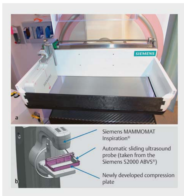
► Fig. 2 a The illustration shows the prototype attached to the Siemens MAMMOMAT Inspiration. The automatic, adjustable ultrasound probe taken from a Siemens S2000 ABVS system is seen mounted on a threaded rod (left in picture) up against the transparent gauze that provides breast compression. b Schematic representation of the integrated mobile ultrasound probe-gauze unit.