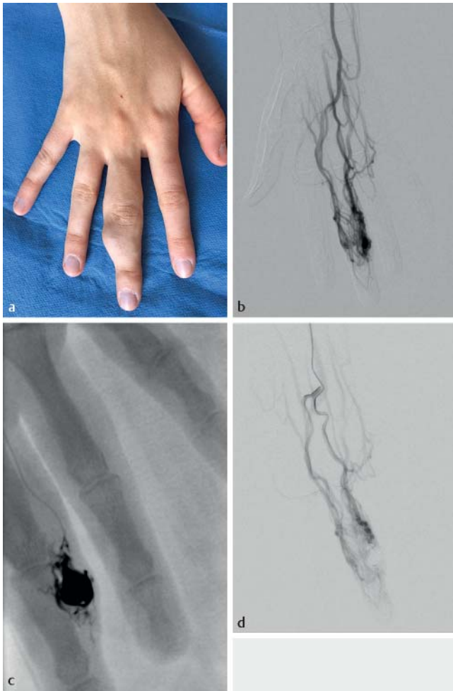
► Fig. 2 Arteriovenous malformation (AVM) of third digit of the right hand in a 26-year-old patient. Macrodactyly, swelling, hyperthermia and massive pulsation were affecting the patient a . Angiography demonstrates a fast-flow AVM of the palmar arch b . Superselective placement of the microcatheter in the nidus of the AVM and embolization with Onyx c . Postinterventional angiography demonstrates devascularization of the nidus of the AVM of the third digit d .

ded AVM nidus is an important part of the treatment spectrum. Particularly in extensive nidus embolization close to a joint, occlusion of the AVM with Onyx may represent a functional movement restriction for the patient. A tattoo effect with discoloration of the skin after Onyx embolization of a superficial AVM can also be an indication for nidus resection.