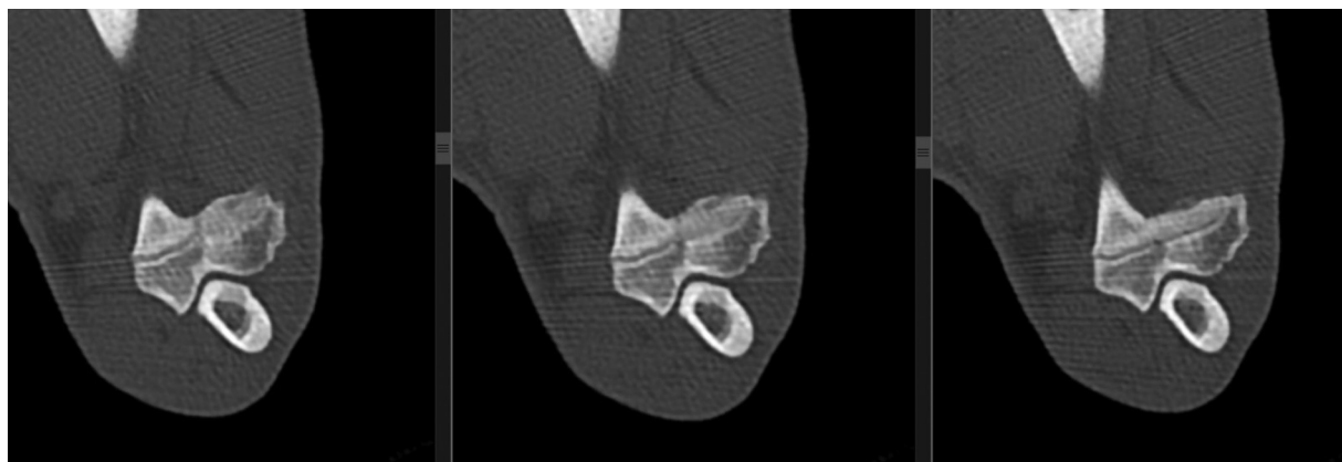
Fig. 2 Day 36 right humeral condyle (W/L 500:2500) viewed in serial transverse images through the humeral condyle showing a faint hypoattenuating intracondylar line bordered by hyperattenuating sclerotic bone.