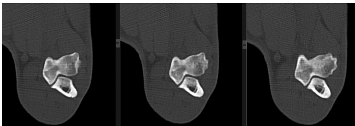
Fig. 3 Day 105 right humeral condyle (W/L 500:2500) viewed in serial transverse images through the humeral condyle showing a faint hypoattenuating ovoid intracondylar region bordered by mildly hyperattenuating sclerotic bone. A discrete hypoattenuating line is not present.

parallel to the direction of axial loading promote early ossification, 25,26 while perpendicular or shear forces may cause radiographic physal widening but not a delayed closure. 27 In this present case, it is also possible that strict cage rest, as part of the recommended postoperative management for contralateral humeral condylar fracture repair, leads to a period of reduced forces acting on the condyles providing a biomechanical environment to allow the fissure to ossify. Alternatively, a potential spontaneous resolution of a transient elbow incongruity may have occurred during this time period. The latter possibility has been suggested to play a role in the development of medial coronoid process disease, and, as in that condition might be expected to vary in its effect between individuals. 28,29 However, elbow joint incongruity was not detected on initial CT examination to support this theory.