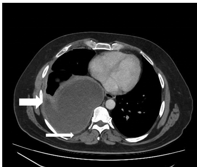
Fig. 1 CT thorax showing a loculated pleural effusion with pleural enhancement, the split pleura sign ( broad white arrow ), and increased extra-pleural fat attenuation ( thin white arrow ). Pleural phase CT demonstrates visceral and parietal pleural enhancement, resulting in the “split pleura” sign. CT, computed tomography.

Cross-sectional imaging with CT can identify collections that are not visible on CXR or TUS (e.g., paramediastinal or fissural