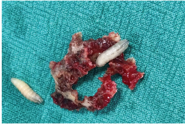
Fig. 3 The eroded bone was debrided in surgery.

the wound for the maggots to come out of the wound site. They were then handpicked using a forceps and around 25 to 30 maggots were removed. The osteomyelitic calvarial bone was debrided (►Fig. 3). The maggots were live and motile. Attendants were shown the organisms.