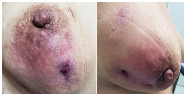
Fig. 1 Erythema, plogosis and ulceration with active suppuration in the lower quadrante. Gynecology Oncology and Breast Unit. INMP.

Among the 21 patients who had radiographic evaluation, the most frequent classification was BIRADS 0, in 16 patients.