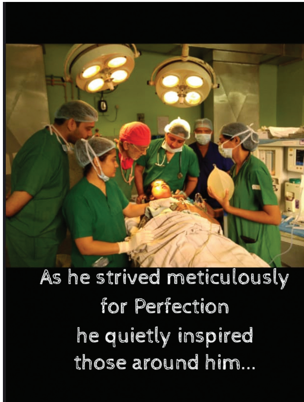
Fig. 2 At St. Martha's Hospital, Bangalore.