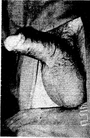
Fig. 1. Erect Penis—Pre-operative.