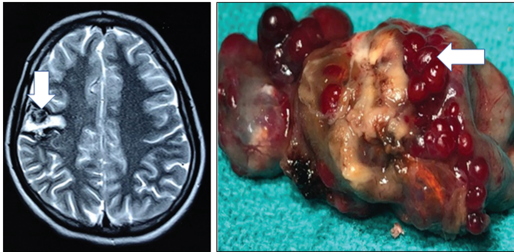
Fig. 1 Magnetic resonance imaging brain showing right posterior frontal heterogeneously hyperintense cortical lesion with intralésional hematoma and thrombosis (white arrow) suggestive of cavernous malformation (A). Resected specimen from right posterior frontal lobe showed a 4 × 3 cm capsulated brownish yellow solid-cystic mass with mulberry like projections (white arrow; B).

radiological findings. Here, we are reporting first case of CCM with concomitant ICM in a young immunocompetent female without any risk factors.