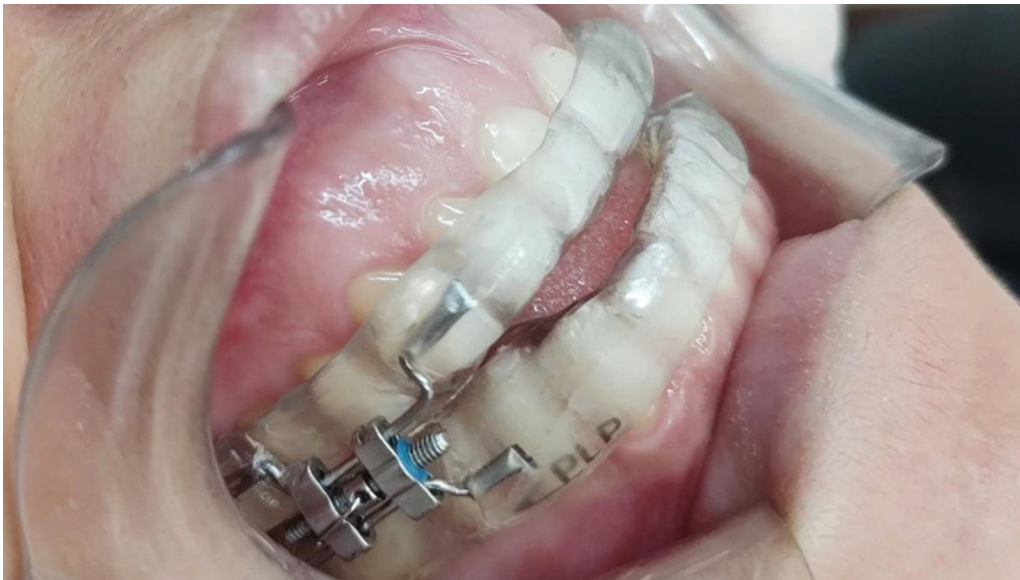
Fig. 1 Oral appliance in situ.