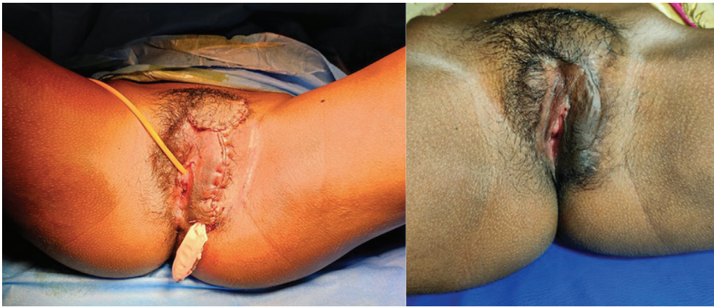
Fig. 3 Postoperative images of the vulva immediately and 1 month after the surgery.