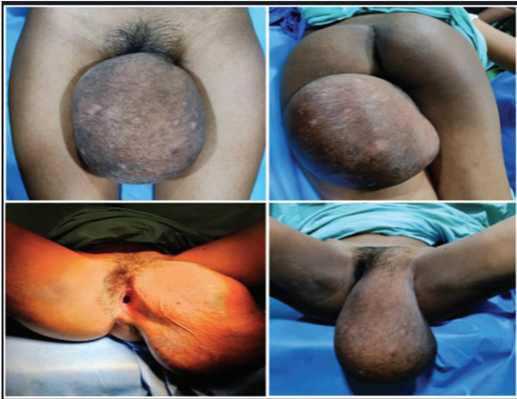
Fig. 1 Clinical photographs showing the swelling.