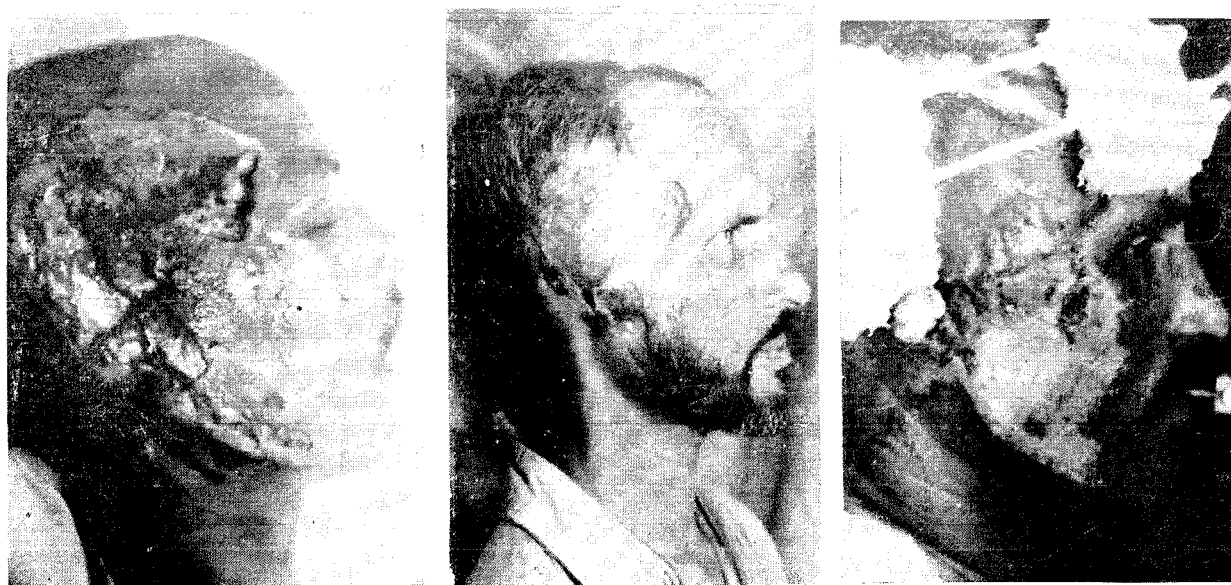
Fig. 1. Crush avulsion of temporal region with abrasion cheek with underlying Leforte II fracture maxilla. Split skin graft of temporal region. Abrasion healed with non adherent dressings.