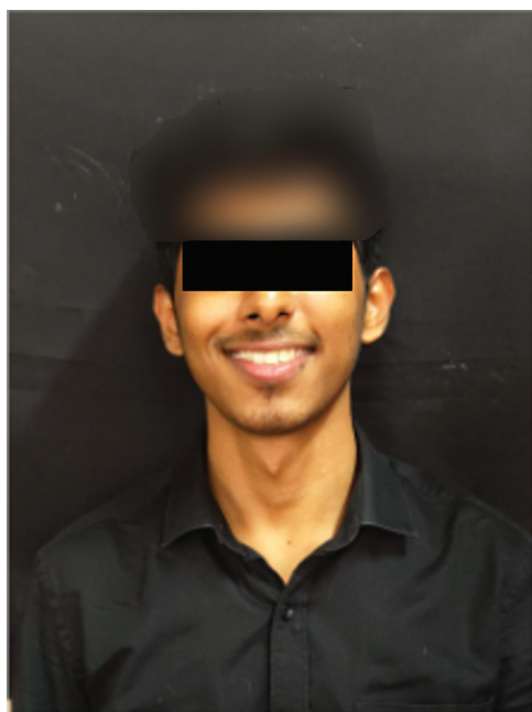
Fig. 1 Positioning of the subject.

This in vivo study was performed in the Department of Prosthodontics and Crown and Bridge of A.B. Shetty Memorial Institute of Dental Sciences NITTE (Deemed to be University), Deralakatte, Mangaluru, on a total of 100 individuals.