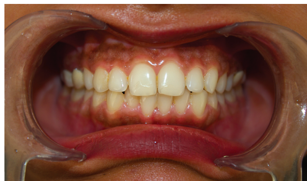
Fig. 2 Photograph of the smile.

It was calculated by dividing the width of each central incisor, lateral incisor, and canine by the total width of all six maxillary anterior teeth and multiplying the resulting