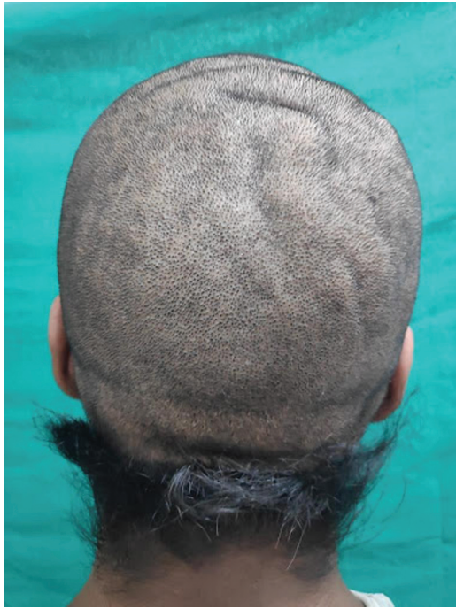
Fig. 4 Posterior view of the scalp showing 2 to 3 regular gyri and sulci.

The lesion was static and did not increase in size. There were no associated itching, pain, acne, or pressure symptoms. No neuropsychiatric or ophthalmic symptoms were seen. The past and family history were nonsignificant. The patient wanted only cosmetic results. On examination two folds resembling gyri could be seen on the occipital region arranged in the alphabetic T pattern. The neurological examination was normal.