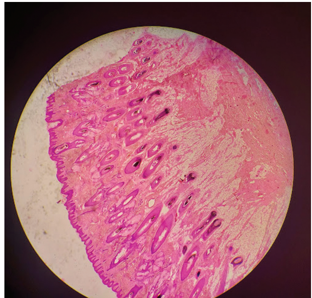
Fig. 2 Low power microscopic image of histopathology analysis of the lesion: Individual cells exhibit minimal atypia. Dermis shows sheets and nests of nevus cells reaching up to the subcutis, adding evidence to our intraoperative finding, suggestive of melanocytic nevi.

The patient was followed up for 6 months. The sutures were removed on postoperative day 14. There were good cosmetic results with normal hair growth on third month of follow-up (► Fig. 3 ). The healing was satisfactory with con-