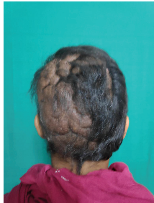
Fig. 3 Postoperative day 14 image showing good cosmetic results.

cealed scarring by hair growth. The patient was satisfied with the aesthetic outcome of surgery. Patient resumed social relations after successful surgery.