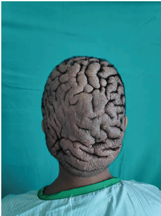
Fig. 1 Posterior view of the scalp showing convoluted skin fold occupying the whole occiput hanging down the neck.

covered with hair and acne were seen. Neurological examination was normal (► Fig. 1 ). But the history points toward CVG due to a secondary pathology of intradermal nevus.