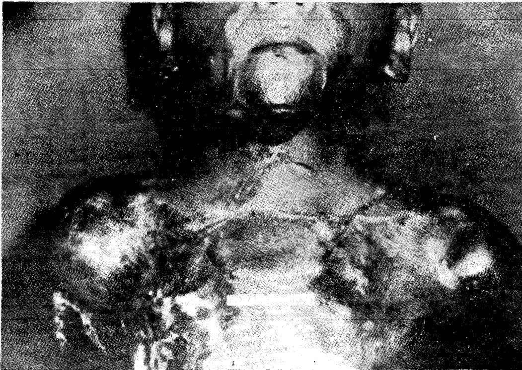
Fig. 2 (b) Post-operative result following the use of 2 flaps to the neck.