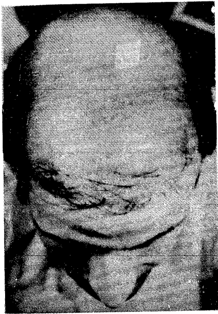
Fig. 3—Showing the hair growth in the frontal region 3 months after operation