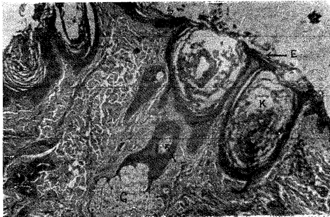
Fig. 5 & 6—Showing histological changes in the bald area on the forehead.