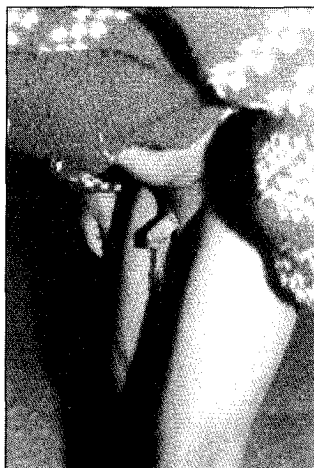
Figure 2: Preoperative photograph showing Subcornal hypospadias with chordee

The cosmetic results were excellent in all patients. Follow up ranged from 3 to 24 months (mean 10 months). Each of the child voided with a well directed full stream (Figures 2 & 3).