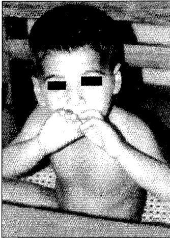
Figure 1: Pre-operative photograph of the patient showing backhanded posture