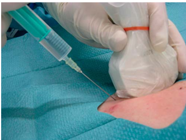
► Fig. 3 Correct application of the sterile ultrasound probe cover in a freehand biopsy with possible contact between the needle and the ultrasound probe. The examiner is wearing sterile gloves. A sterile drape/incise drape as a barrier precaution is obligatory when tools (e.g. syringe) must be changed/set down during puncture.