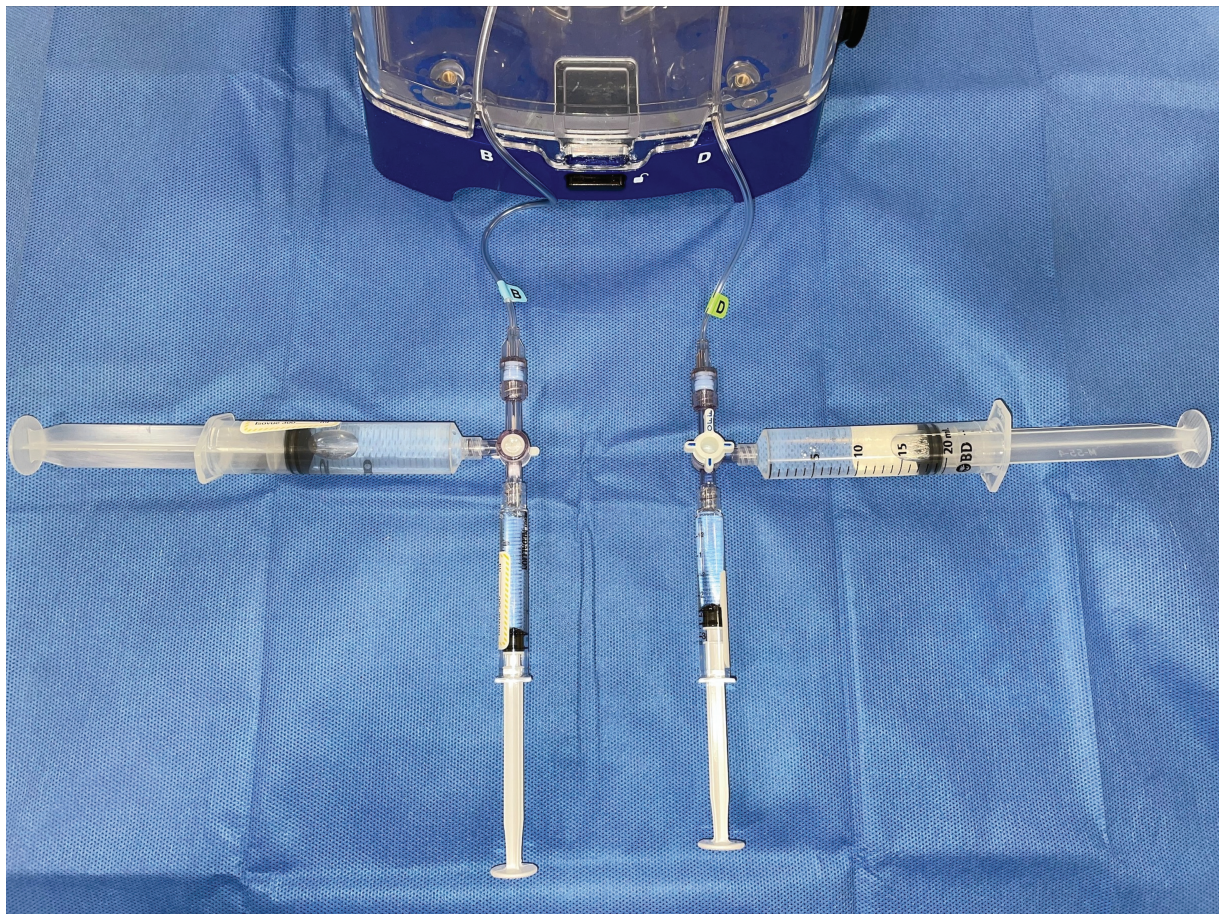
Fig. 2 Syringe setup and configuration during microvascular plug (MVP) assisted temporary vascular occlusion (TeVO) for microsphere loading and flushing.

In our original case series, the MVP was recaptured by handling the noncontaminated external portion of the delivery wire outside of the closed Y-adaptor. In brief, without loosening the hemostatic valve on the Y-adaptor, one could still advance the microcatheter along the pinned delivery wire and minimize release and exposure of adherent microspheres as the potentially contaminated segment of the wire is pulled outside the Y-adaptor. The newly exposed “hot”