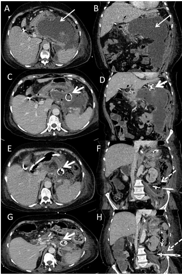
Fig. 3 Group 2: endoscopic to percutaneous catheter drainage interval of 18 days: (A, B) Contrast-enhanced computed tomography (CT) showing walled-off necrotic (WON) collections in lesser sac with extension into the left pararenal space and left paracolic gutter (white arrows). Cystogastrostomy was done on day 33 of the illness. (C, D) CT after cystogastrostomy shows the stent in situ (thick white arrows) with significant collection in the left paracolic gutter. Percutaneous catheter drainage was done on day 51 of the illness; (E, F) CT after percutaneous catheter insertion (dashed white arrow in F); (G, H) CT done in the ninth week of illness shows a significant reduction in the size of WON.

who did not respond to PCD alone as safe and effective for patients with infected WONs. 20 However, to our knowledge, none of the reported studies has systematically reported the impact of the timing of PCD following initial endoscopic drainage of WON.