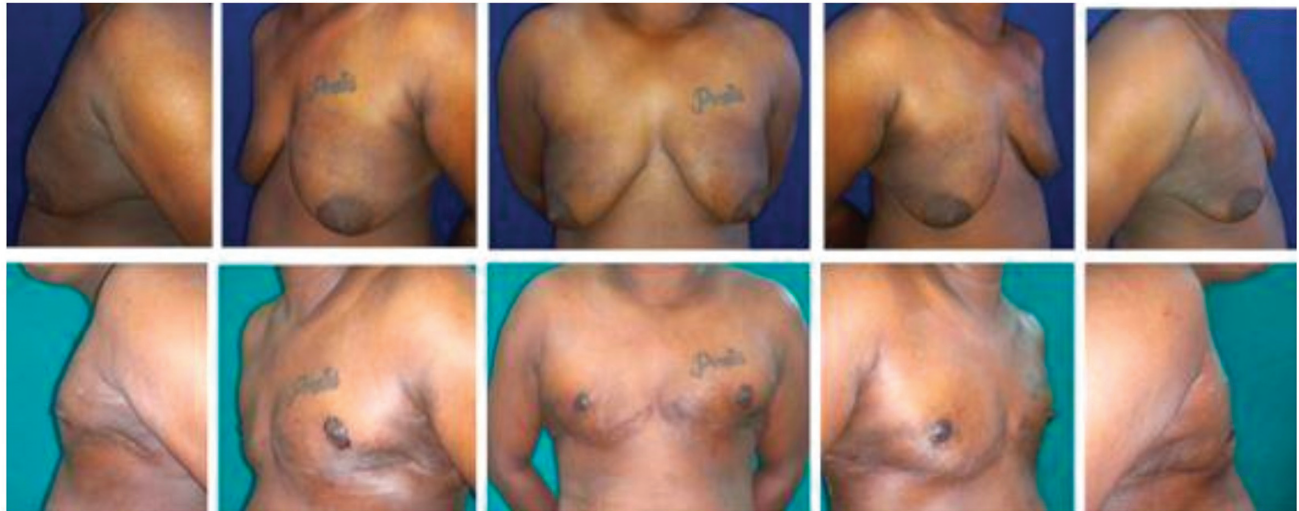
Fig. 5 Pre- and postoperative photographs of case 2.

examination, the patient had a B cup breast size with a hypertrophied NAC, surplus fat over the anterior axillary fold, well-defined axillary tail, and good-quality skin. The patient was assessed in the multispecialty integrated transgender clinic for suitability of top surgery. The patient had undergone a combination of liposuction, subcutaneous mastectomy, and free, reduced nipple–areola grafting. The patient had an uneventful postoperative recovery. The patient was followed up for 18 months with a final computed IAOAS score of 21.