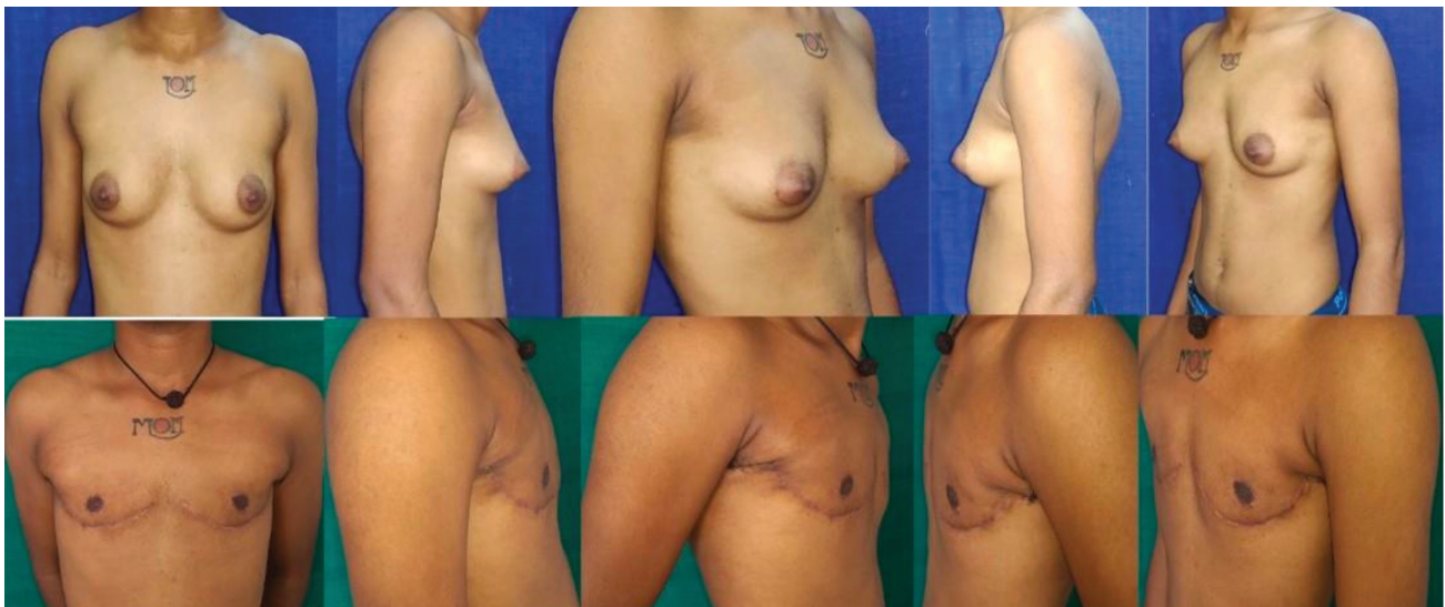
Fig. 4 Preoperative and late postoperative photographs of case 1.

A 21-year-old transman came to the transgender clinic and opted for top surgery as the first gender-confirming surgery (► Fig. 4 ). The patient gave a history of cross-dressing for 8 years and using breast binders for the past 3 months. On