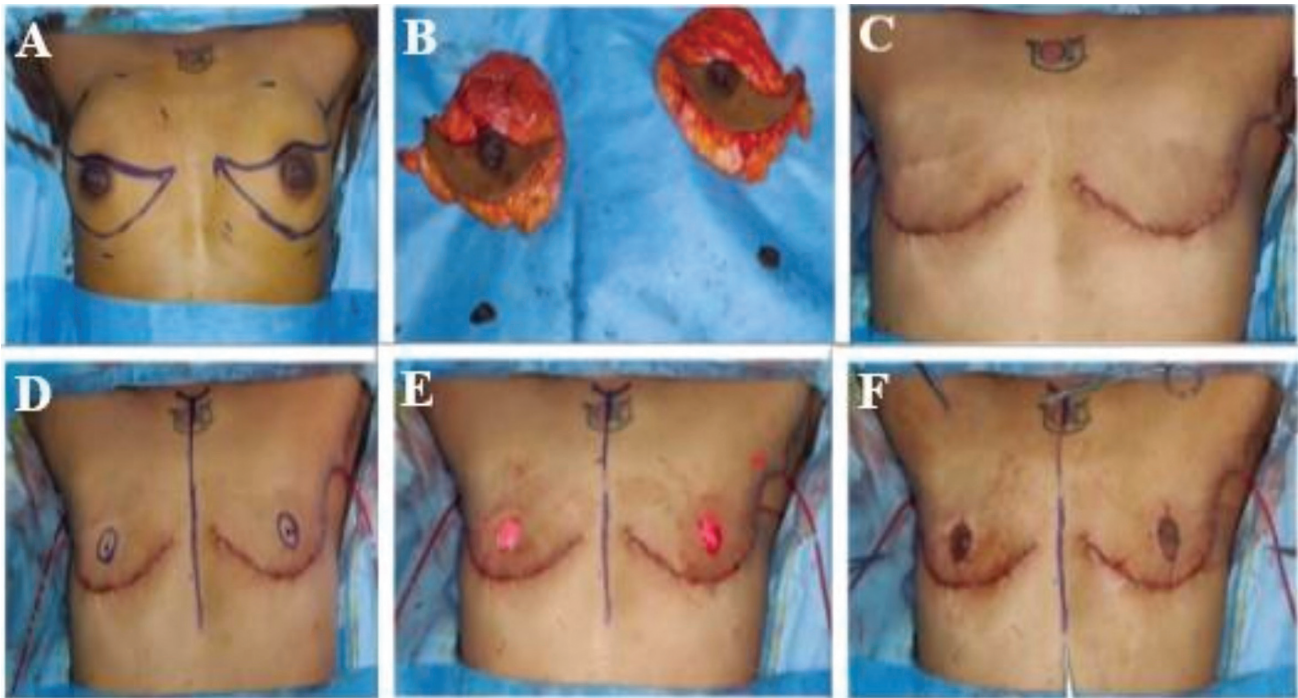
Fig. 3 (A) Markings of elliptical incisions for bilateral (B/L) subcutaneous mastectomy and liposuction. (B) Excised breast specimens with harvested reduced free nipple-areola grafts. (C) Closure of mastectomy incisions. (D) Marking for de-epithelialization for neo-NAC. (E) De-epithelialized skin for neo-NAC. (F) Fixed B/L reduced inert NAC graft.

De-epithelialization was done in the marked area of neo-NAC (► Fig. 3E ), and after achieving hemostasis, the reduced free nipple-areola graft was sutured edge to edge with 5-0 Poliglecaprone (► Fig. 3F ). A compressive dressing was applied.