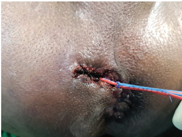
Fig. 2 The composite seton after application.

The composite seton was made by suturing together two silastic vessel loops of different colors (to help suturing) with 5-0 polypropylene continuous sutures for