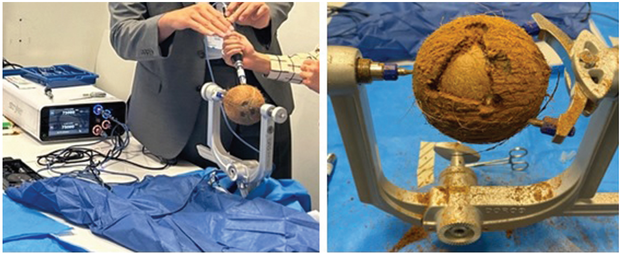
Fig. 4 Using coconut shells to simulate burr holes and craniotomy. Each delegate had the opportunity to perform craniotomy on a coconut shell. This involved using a perforator to create multiple burr holes, and then connect these together with a craniotome to complete a craniotomy. The coconuts were secured to the work surface with a Mayfield.

opportunity to challenge themselves in using a diamond drill on a boiled or raw egg (see ► Fig. 5 ).