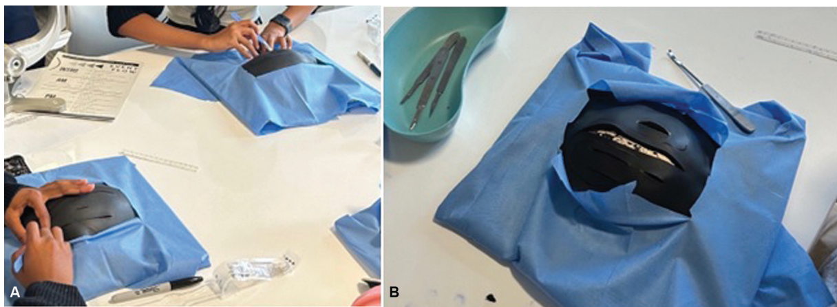
Fig. 3 (A, B) Neoprene for simulation of cranial skin flap techniques. We used custom-cut sheets of this material to cover and stick to the low-cost calvariums (using its adhesive bottom surface). The neoprene was of appropriate thickness to simulate layers of the scalp, as well as for penetration by a scalpel. Surgical drapes were used for additional visual simulation value.

by the polymerization of chloroprene, 21 and is commonly known for its use in wetsuits. Using this relatively affordable material avoided the need to purchase expensive Rowena head models that include a scalp layer. We were also inspired by Drummond-Braga et al 22 and used coconuts to simulate skull models, and facilitate the practice of burr holes and craniotomy (see ►Fig. 4). Boiled eggs have also been shown to successfully model the skull in surgical simulation. 23–26 Considering this, we provided each delegate with the