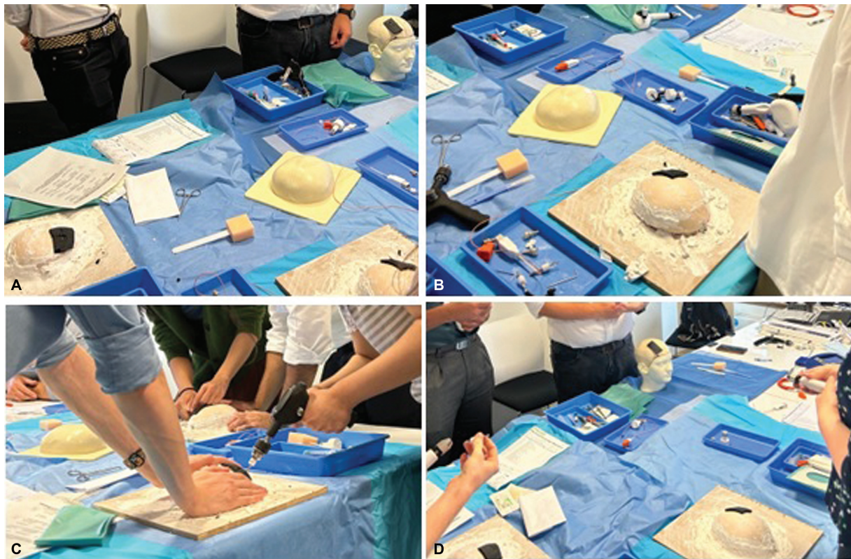
Fig. 2 (A–D) Cost-effective simulation for external ventricular drain and intracranial pressure monitoring. Handmade calvarium models were with cranial suture markings that were fixed to square plywood boards using Plaster of Paris. Internal to the calvarium was a small-sized bin/trashcan bag filled with children’s play slime to model the dura and brain parenchyma, respectively. A small block of neoprene was added to model the area of scalp where the suture would be made.

used these models for our EVD and ICP monitoring skills session, with significant success (average student rating 4.61 out of 5; see ►Fig. 2A–D).