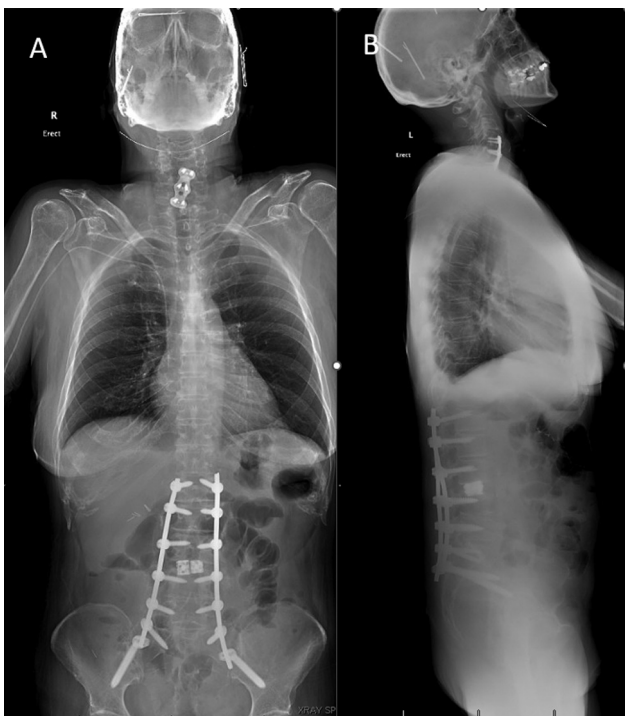
Fig. 3 (A) Anteroposterior and (B) lateral 6 weeks postoperative long cassette standing films demonstrating restoration of global sagittal alignment.

Abbreviations: C7 SVA, sagittal vertical axis (cm); LL, lumbar lordosis; PI, pelvic incidence; PT, pelvic tilt; TK, thoracic kyphosis; TPA, T1 pelvic angle.