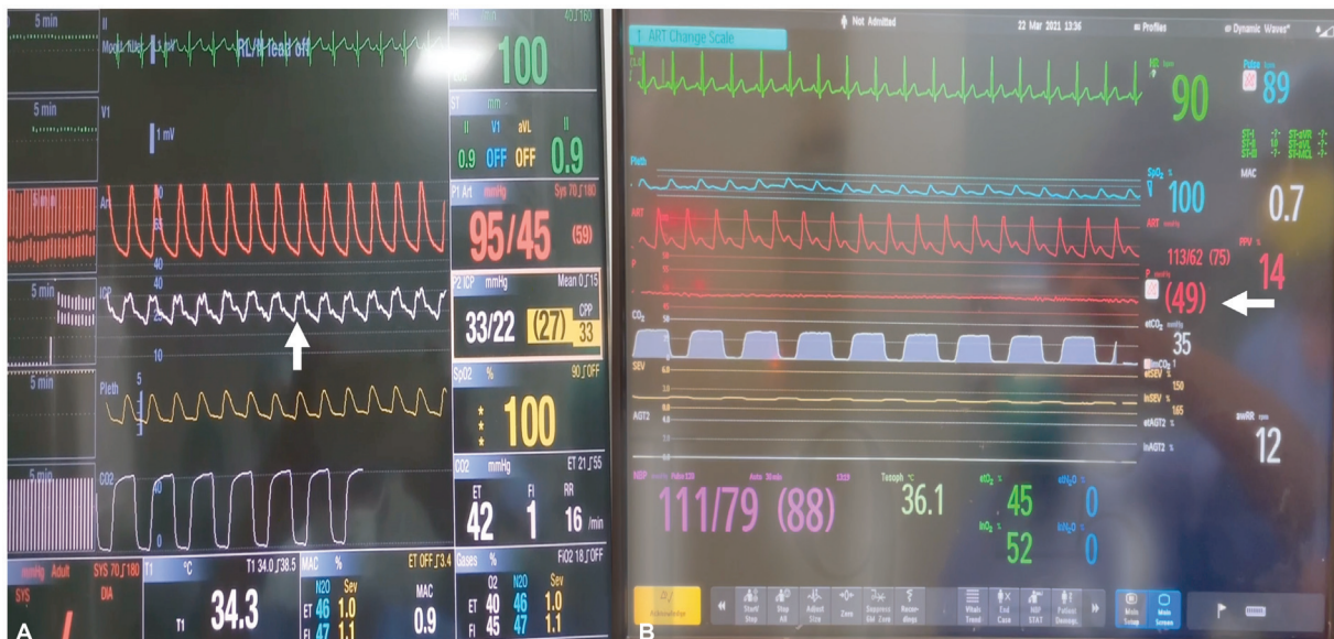
Fig. 2 (A) Appreciable intraventricular pressure (ICP No) waveform and value (white arrow). (B) Absolute ICP value without appreciable ICP waveform (white arrow).

To explore the feasibility of continuous intraoperative ICP monitoring, subdural ICP was measured in three patients using an intravenous cannula connected to the pressure transducer. Subdural ICP monitoring in these patients helped to make critical intraoperative clinical decisions based on the