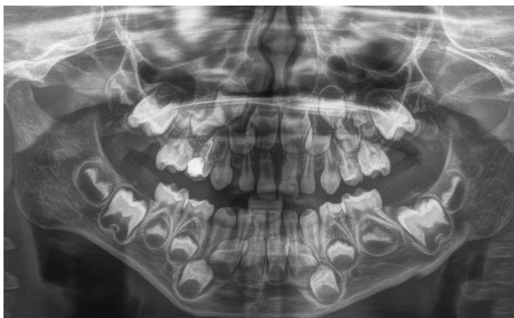
Fig. 3 Orthopantomogram (OPG) showing entire dentition (bi-rooted 53 and 63).

An uncommon dental abnormality is a main maxillary canine with two roots. Bi-rooted deciduous canines are more common in the maxilla rather than the mandible, and they are frequently seen on either arch. 8 Additionally, children who are black and who are male are more likely to