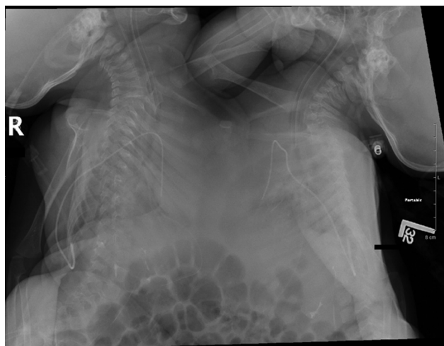
Fig. 1 Twins with the most common type of union (thoraco-omphalopagus).

during the prenatal ultrasound screening, and it can be detected in the 12th week of gestation. Further scanning at 20 weeks can help elucidate the shared viscera. 7 During prenatal ultrasonography, continuous skin covering between two fetuses is the most sensitive and specific finding for conjoined twins. 8 Planning for twin separation requires further imaging utilizing computerized tomography or magnetic resonance imaging. Although these modalities can be used antenatally, they will be more accurate if performed after delivery. 7