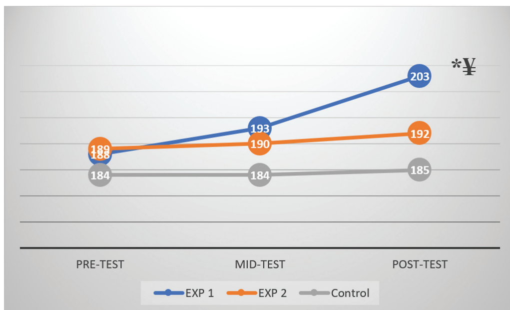
Fig. 2 Muscle hypertrophy of study participants. All values are presented as mean \pm standard deviation. *Significant differences compared with pretest; †significant difference compared with the control group. EXP1, Experimental Group 1; EXP2, Experimental Group 2.

changes in physical fitness factors and muscle hypertrophy, reinforcing the synergy between dietary supplementation and physical training.