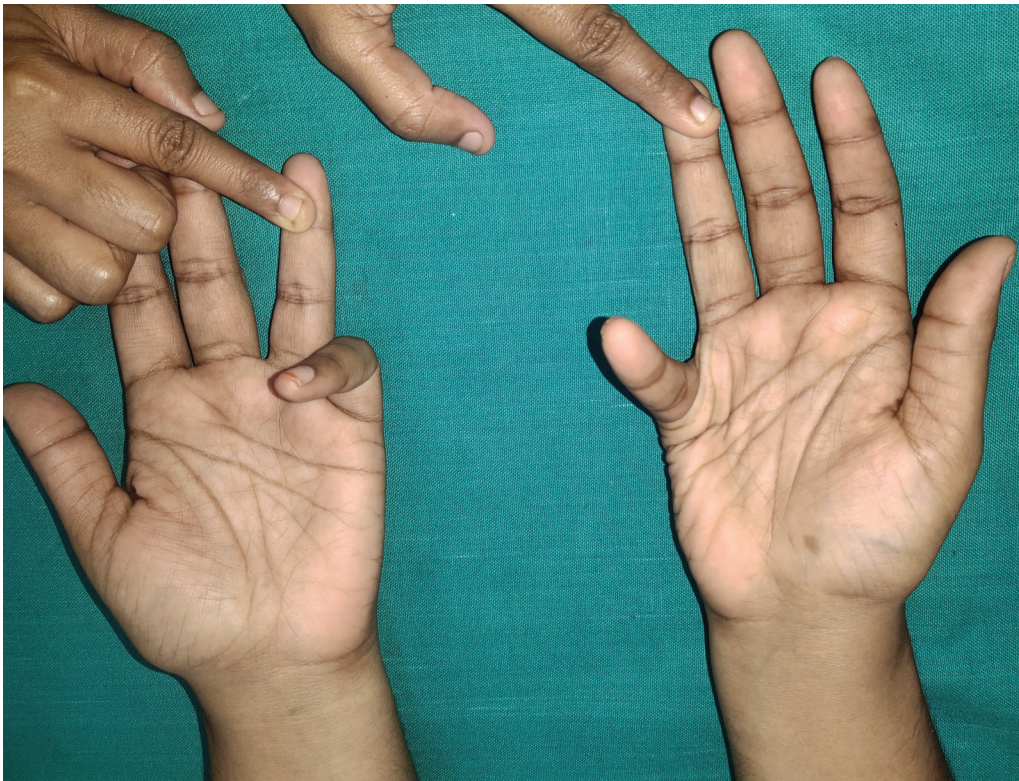
Fig. 2 The standard test shows the absence of functional flexor digitorum superficialis (FDS) of the little finger in the right hand and its presence in the left hand.