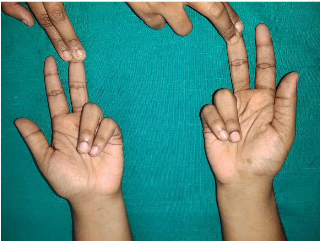
Fig. 3 The modified test. The same hand in ► Fig. 2 shows a functional flexor digitorum superficialis (FDS) of the little finger in the right hand on performing the modified test.