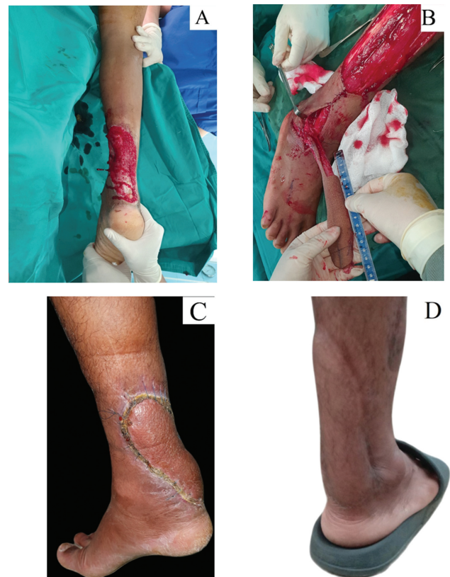
Fig. 4 Heel reconstruction by retrograde lateral supramalleolar (LSM) flap. (A) Wound before operation. (B) Flap dissection. (C) Flap healing in the recipient site 20 days postoperation. (D) At 14 months postoperation.

For the defects in the midfoot and forefoot, the sural flap had been usually used. However, the sural flap's posteriorly located pivot point necessitates the subcutaneous pedicle to traverse around the ankle to reach the anterior region, thereby compromising aesthetic outcomes in forefoot reconstruction. With a mean length of 17.46 cm, retrograde LSM