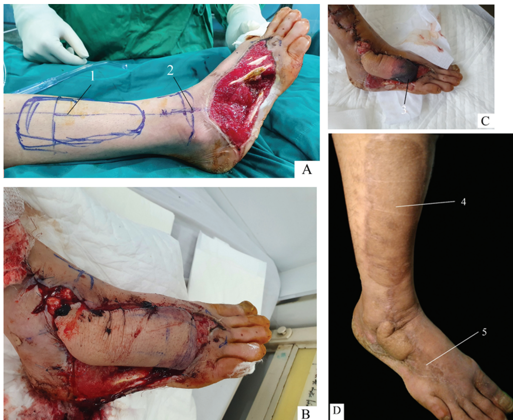
Fig. 3 Third failure case with partial flap necrosis. (A) Wound before surgery. (B) First operative day. (C) Severe venous congestion led to partial flap necrosis. (D) Result after the second skin graft procedure.

The overall successful outcome of this study was 91.3% (42 of 46 flaps). Donor site healing proceeded uneventfully following the skin graft procedure, with no evidence of tendon adhesion in any case.