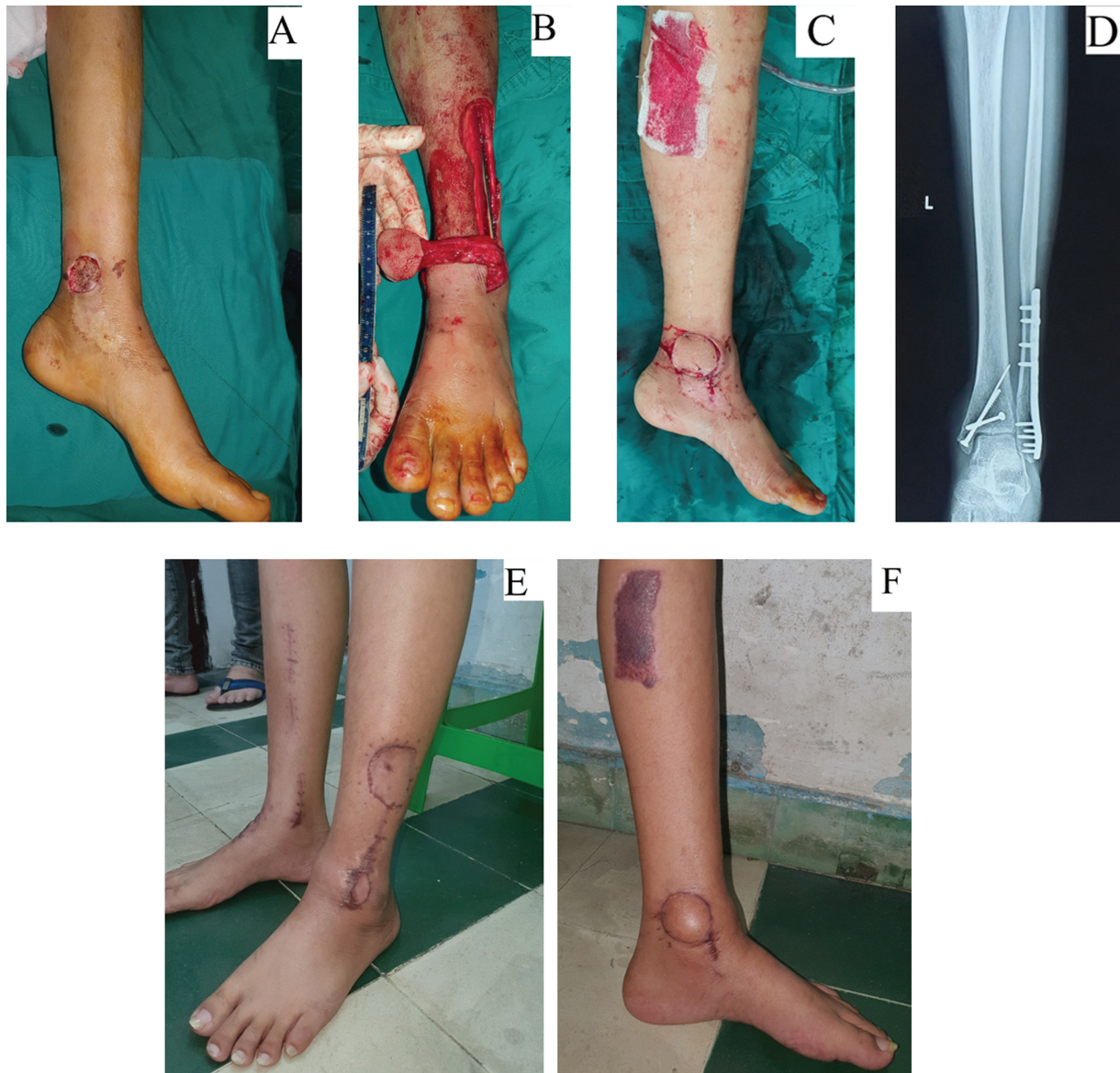
Fig. 5 Combined flap dissection with bone fixation in one procedure. (A) Expose medial malleolus fracture. (B) Bone fixation by plate and flap elevation. (C) Closing the wound by retrograde lateral supramalleolar (LSM) flap. (D) X-ray image of bone fixation. (E) Donor site healing by a skin graft. (F) Flap healing.

Although the overall success rate of the study was high (91.3%), there were failed cases. Two of the failed cases had pedicle tunnel techniques in which long flaps (19 cm in total length) were passed through a tunnel to the recipient site. This tunnel might be small and cause pressure on the pedicle, compromising the blood supply to the flaps. Additionally, maybe the flaps failed because their dimensions were large (66 cm 2 ) and they covered soft-tissue defects far in the forefoot. It was wondered whether using vasodilators, maintaining a warm temperature around the postoperative flaps, and local heparin could help prevent venous congestion, rescue these flaps, and enhance flap survival.