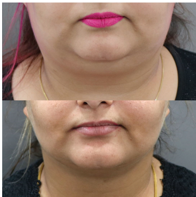
Fig. 5 Facial slimming achieved in a patient with high BMI (35); results at 3 months.