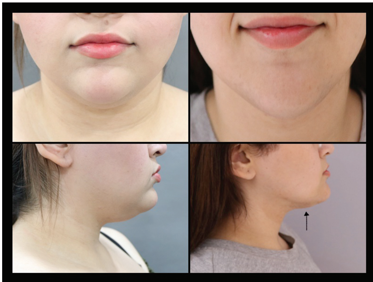
Fig. 4 Postbariatric surgery patient with mild skin laxity (arrow) at the 1-year follow-up with overall satisfactory result.

The most common complications of this procedure include bleeding, hematoma, seroma, hyperpigmentation, infection, paresis of the marginal mandibular nerve, fibrosis, over-resec-