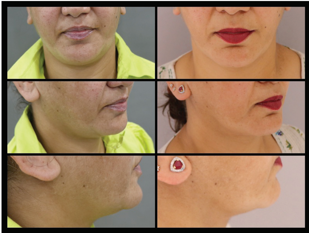
Fig. 3 Before and after pictures at the 6-month follow-up (front, oblique, and side view).

As per the patient satisfaction index (► Table 1 ), responses 1 and 2 were considered overall satisfactory results. Out of 50 patients, 40 responded as 1, 10 as 2, and none as 3 and 4.