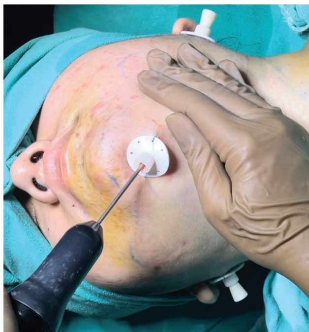
Fig. 2 Intra-op picture depicting VASER (vibration amplification of sound energy at resonance) probe inserted via secure skin ports.