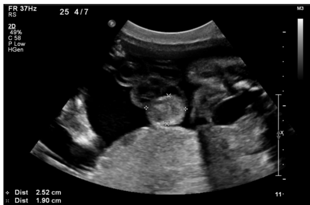
Fig. 3 Umbilical cord mass measuring 2.5 × 1.9 cm.

term and weighed 3.324 kg. During the procedure, the umbilical cord was cut long to prevent injury to the bowel.