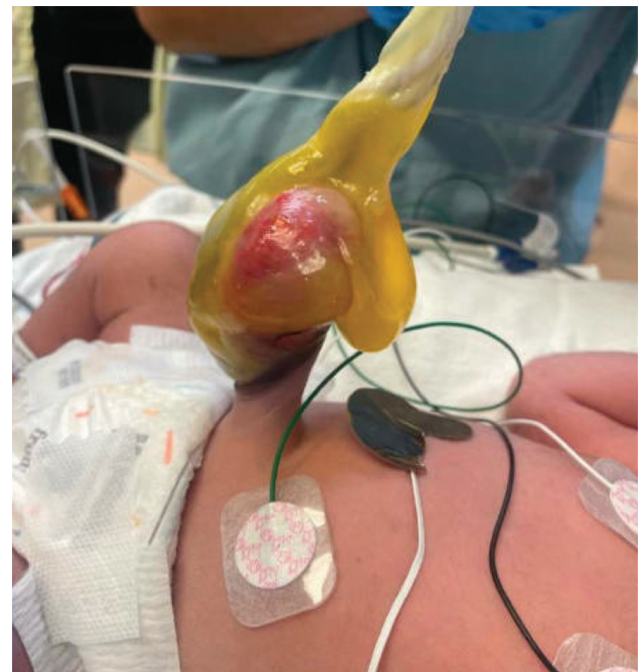
Fig. 4 Intestinal contents protruding through the umbilical cord, with an associated outer membrane.

A congenital umbilical cord hernia is a rare and incompletely understood phenomenon in which intestinal contents protrude into the umbilical cord secondary to umbilical ring patency. 1 This condition is estimated to occur in 1/5,000 live births and is often misdiagnosed as a small omphalocele. In addition to differentiating these two entities, a congenital umbilical cord hernia should also be distinguished from a postnatally diagnosed umbilical hernia; the former is