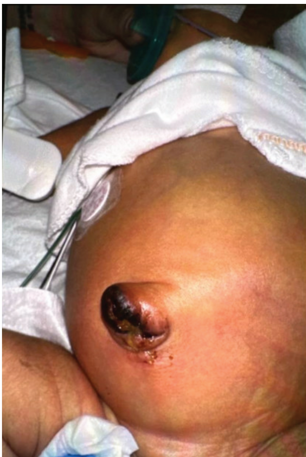
Fig. 5 Post-umbilical cord hernia repair and reduction.

postulated to arise from persistent physiological midgut herniation while the latter is due to failure of the fusion of the rectus abdominis muscle at the midline after retraction of physiologic intestinal contents during gestation. 2,3